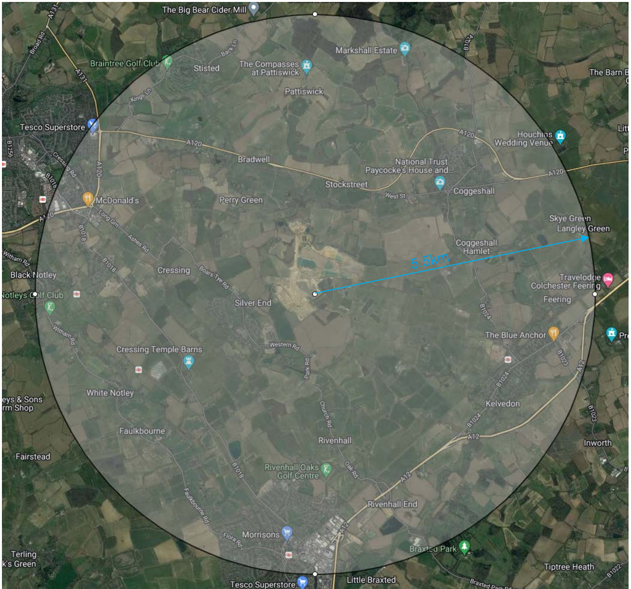
Figure 1 – Local Community Consultation Zone

4.13 Consultation will not be limited to this zone. Indaver will publish notices in a local newspaper for two consecutive weeks, plus a notice in one national newspaper and the London Gazette near the start of the consultation period. These notices will provide broadly the same information as the consultation letter – setting out where information can be accessed, the date(s) and time(s) of the community drop in event(s), how feedback on the Proposed Development can be given and the deadline for doing so.